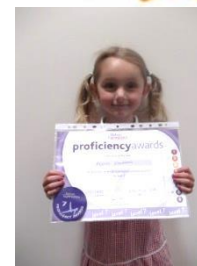
Peony – Ash Class