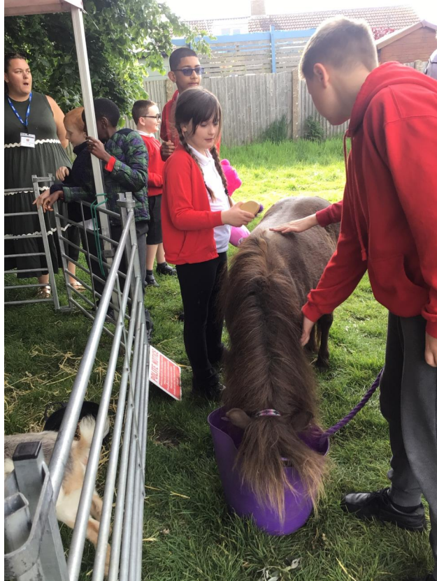
Gold awards for Parklands School