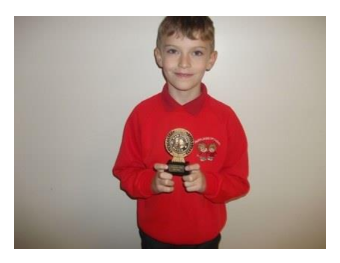
1 - A super star for receiving a 'Man of the Match' football trophy with Colt's U9's Reds football team.