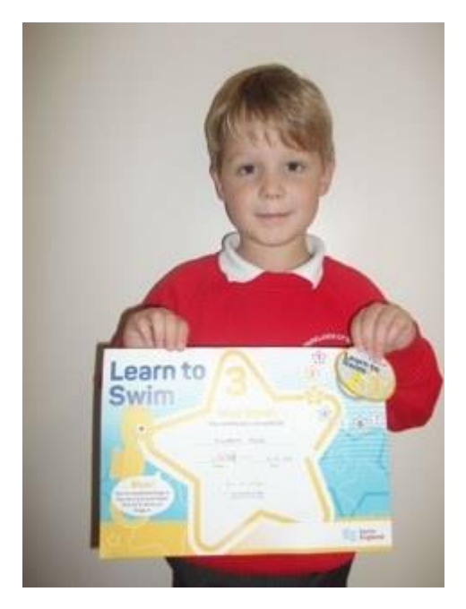
2 - A super star for receiving a Level 3 learn to swim certificate with Swim England.