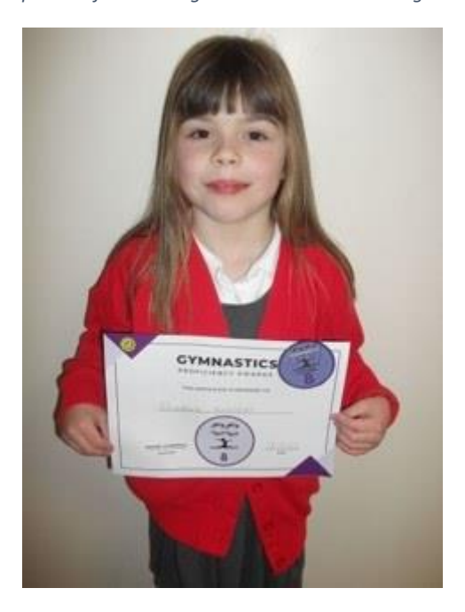
16 - A Super Star for receiving Gymnastics Proficiency Awards Level 8 with CC Gymnastics