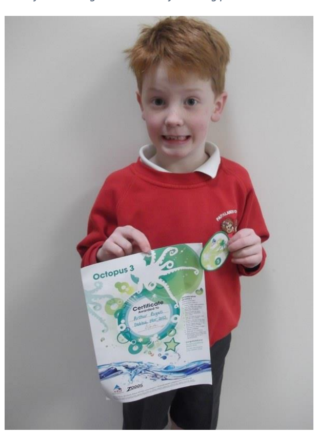
14 - A Super Star for receiving Octopus 3 Swimming Badge and Certificate with STA UK