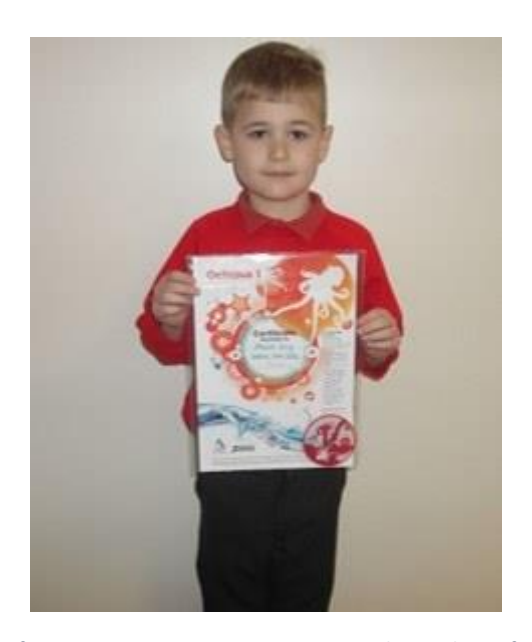
21 - A Super Star for receiving Octopus 1 Swimming Badge and Certificate with STA UK