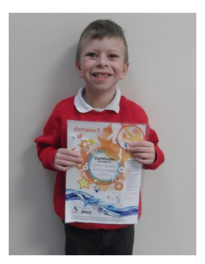
9 - A Super Star for receiving Octopus 2 Swimming Badge and Certificate with STA UK