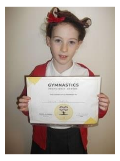
1 - A Super Star for receiving Gymnastics Proficiency Award Certificate with CC Gymnastics