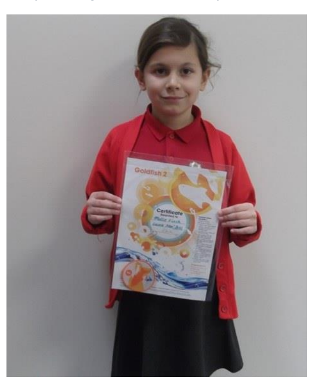
20 - A Super Star for receiving Goldfish 2 Swimming Badge and Certificate with STA UK