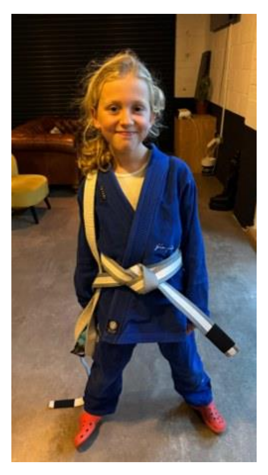
{\it 22-A Super Star for receiving grey and white belt from Brazilian Jiu Jitsu grading.}