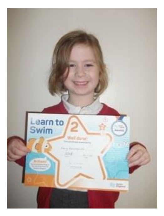
17 - A Super Star for receiving Learn to Swim Level 2 Certificate with Swim England