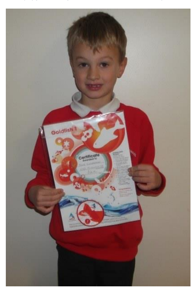
3 - A Super Star for receiving Goldfish 1 Swimming Certificate with STA UK