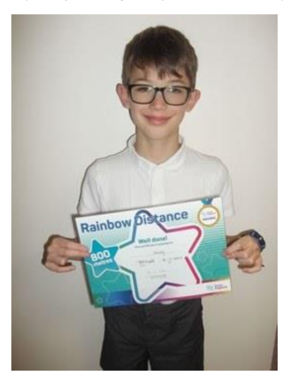
8 - A Super Star for receiving Rainbow Distance Swimming Certificate for completing 800 metres with Swim England