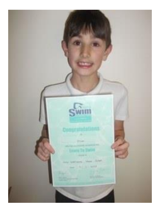
15 - A Super Star for receiving Learn to Swim Swimming Certificate