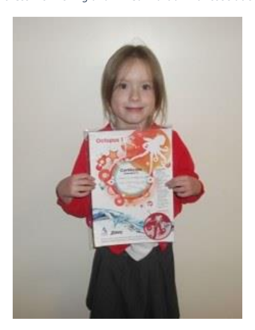
5 - A Super Star for receiving Octopus 1 Swimming Badge and Certificate with STA UK