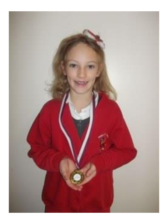
13 - A Super Star for receiving a Gold Medal for taking part in a Football Tournament