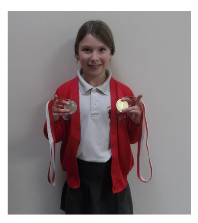
11 - A Super Star for receiving Gold '1st Place' Medal and Silver '2nd Place Medal' in gymnastics for floor and volt at Westgate Leisure Centre