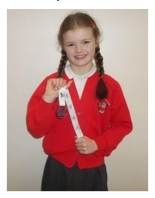
12 - A Super Star for receiving Silver '2nd Place Medal' in gymnastics for floor and volt at Guildford Leisure Centre