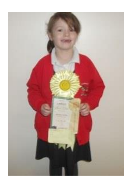
19 - A Super Star for receiving Level 1 Rosette and Certificate with Lavant Equestrian