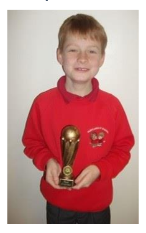
7 - A Super Star for receiving 'Man of the Match' Football Trophy