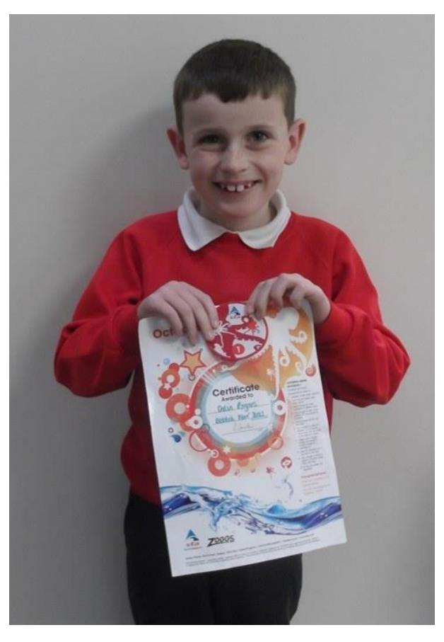
10 - A Super Star for receiving Octopus 1 Swimming Badge and Certificate with STA UK