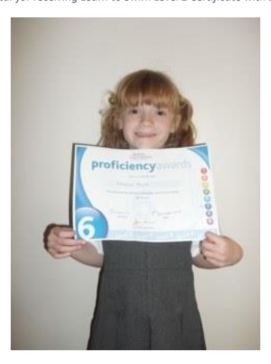
18 - A Super Star for receiving British Gymnastics Proficiency Awards Level 6