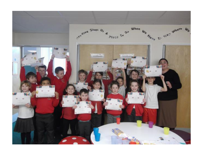
Super Star Corner