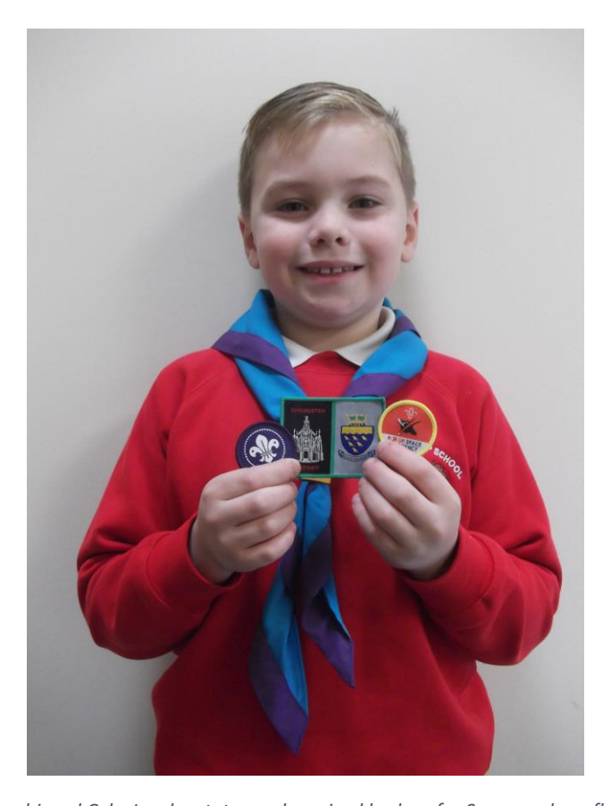
4 - Superstar Austin has achieved Cubs Leader status and received badges for Space and a reflective visit to the Church