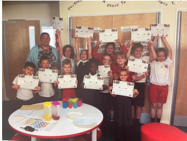
Super Star Corner