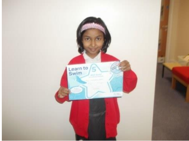
1 - A super star for receiving a learn to swim certificate and badge from swim England - level 5.