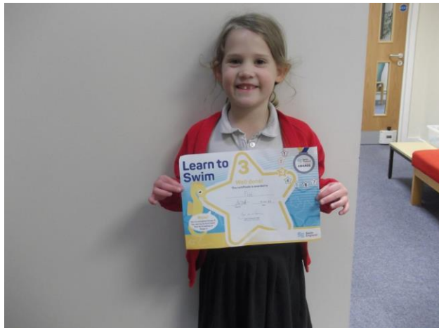
2 - A super star for receiving a learn to swim certificate from swim England - level 3.