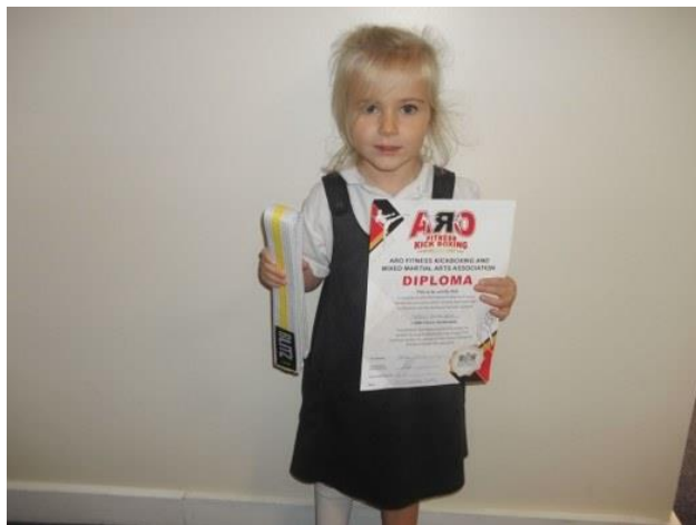
5 - A super star for receiving her certificate and yellow stripe belt with ARO Fitness Kickboxing and Mixed Martial Arts Association.