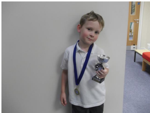
3 - A super star for receiving a trophy and medal for competition winner with Pompey in the Community.