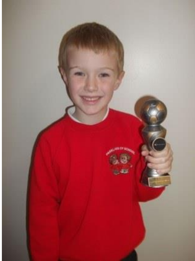
4 - A super star for receiving his shooting challenge winner trophy from kick star sports.