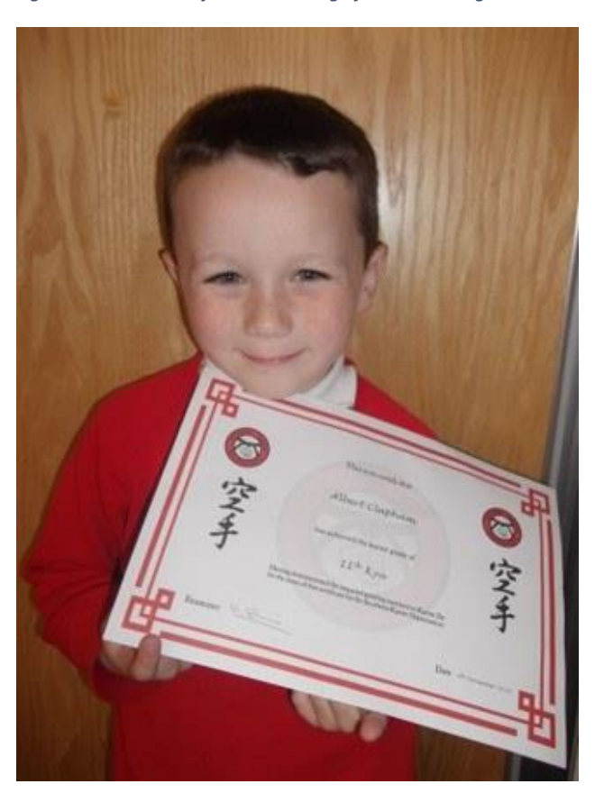
4 - A super star for receiving his Karate Grade of 11th Kyu with Southern Karate Organisation.