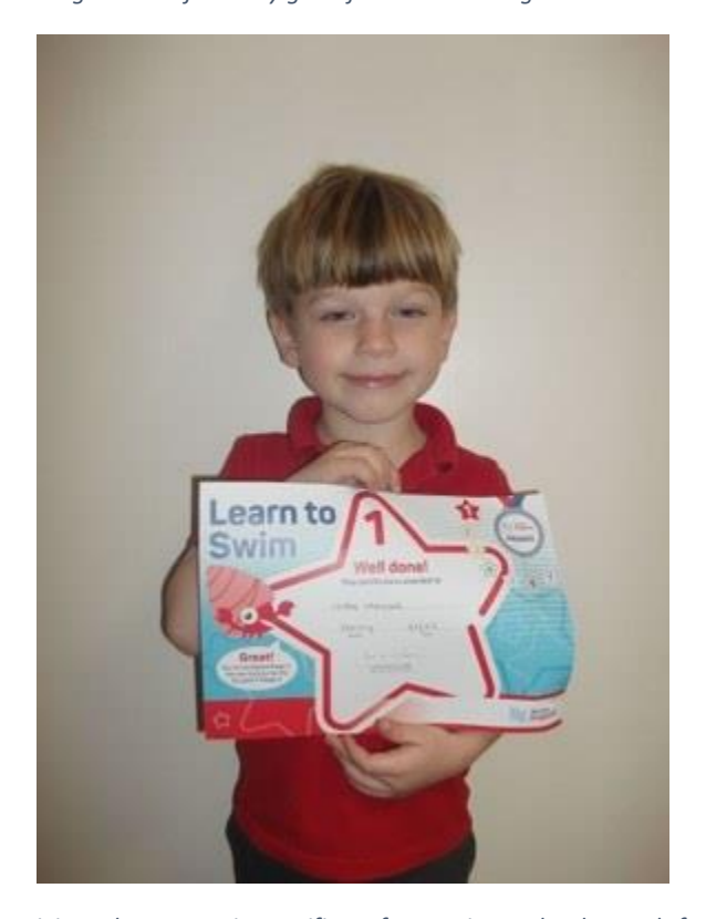
2 - A \ super star for \ receiving \ a \ learn \ to \ swim \ certificate \ from \ swim \ England \ awards \ for \ completing \ Level \ 1.