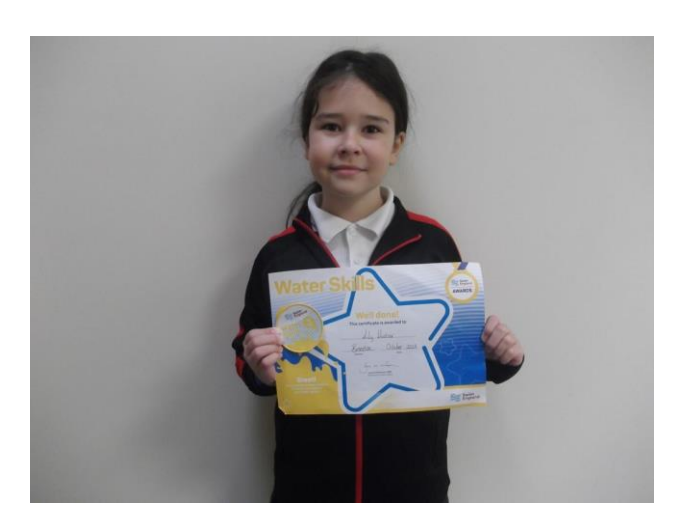
3 - A super star for receiving a water skills certificate and badge from swim England awards for completing Level 3.