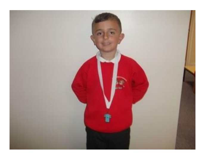
1-A\ super\ star\ for\ receiving\ a\ medal\ for\ really\ good\ football\ with\ Brighton\ and\ Hove\ Albion\ Football\ Club.