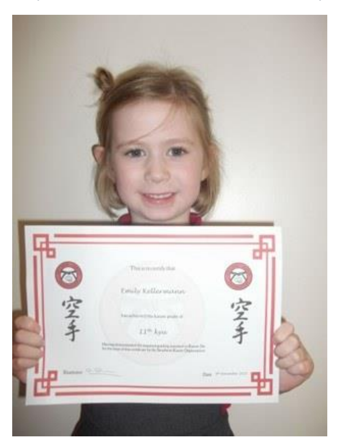
6 - A super star for receiving karate grade of 11th Kyu with Southern Karate Organisation.