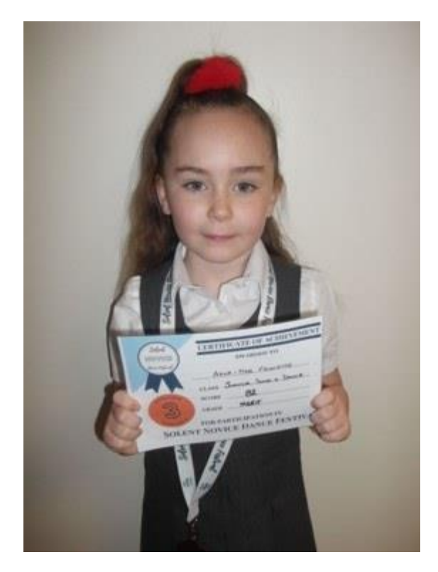
7 - A super star for receiving merit grade certificate of achievement with Solent Novice dance festival.