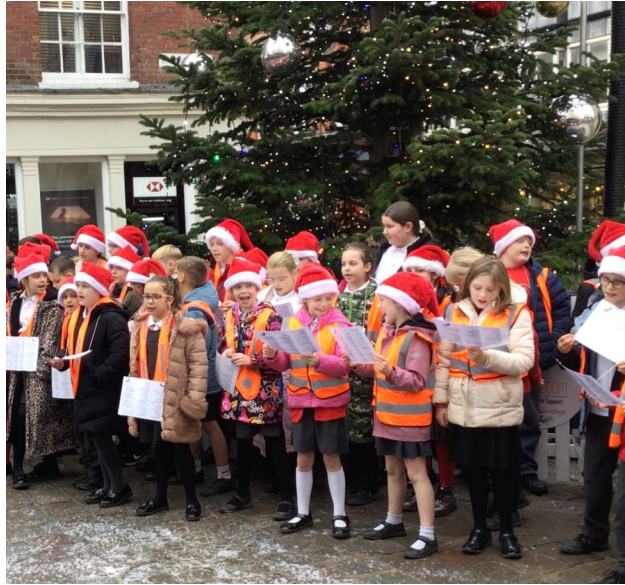
Christmas Dinner Day