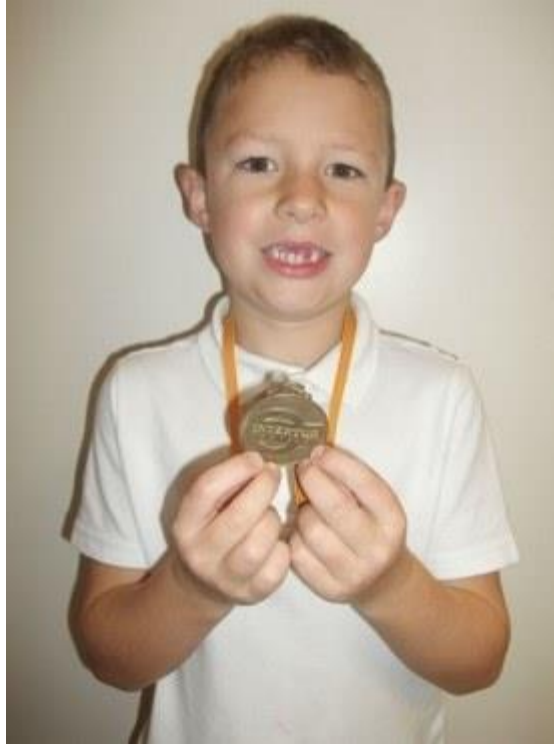
1 - A super star for receiving a rugby medal.